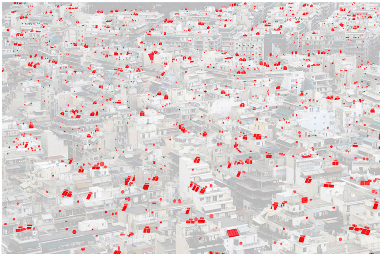
Independencias Athens, 2009, 80 x 120 cm. Edition 3.